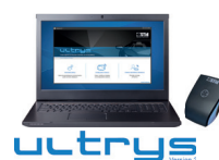
ULTRYS programming kit and SSCP® and OSDP™ protocols