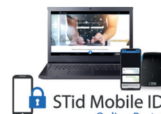
STid Mobile ID Online Portal Web-based platform for remote management of your virtual cards

* Attention: information on communication distances: measured at the center of the antenna, depending on the positioning of the vehicle, the antenna configuration, the installation environment of the reader, the supply voltage, and the local regulations in effect. External disturbances can cause the reading range to decrease. The reading performance depends on the positioning of the tag and the type of windshield. Impervious windshields can affect reading performance. It is imperative to place the tag in the resist zones.