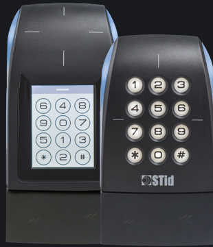
Available in touchscreen versions and keypad