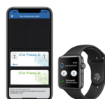
Bluetooth® & NFC smartphones / smartwatches using STid Mobile ID® application