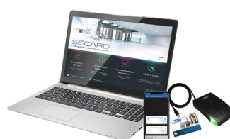
SECARD SECARD configuration kit and OSDP™ protocols